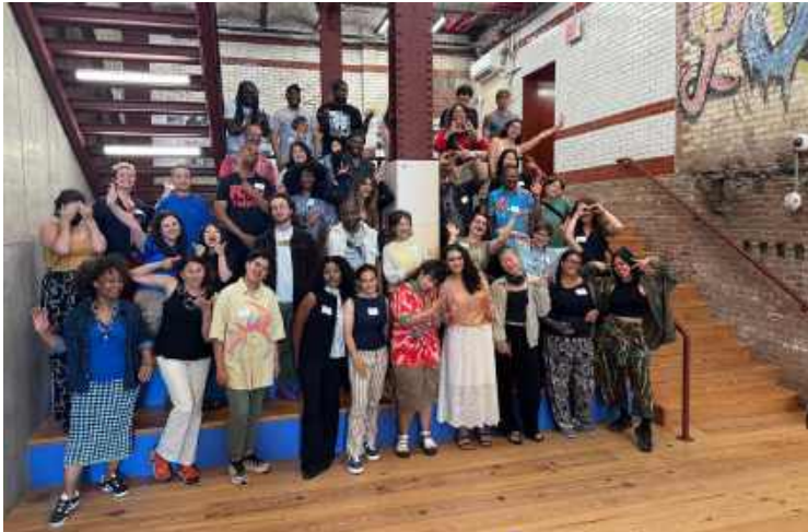
Image: Artist as Entrepreneur participant group photo at Powerhouse Arts; June 2025; Brooklyn, NY

NYFA Learning builds and fosters creative communities through professional development programming offered locally, nationwide, and internationally. We provide tools and resources that artists and cultural workers can apply to their career and/or artistic practice. In FY25, Learning reached approximately 17.5K+ constituents, directly serving 7,200+ individual artists and cultural workers and 95+ organizations —through in-person and online durational professional development programs, workshops, one-on-one consultations, and written resources.