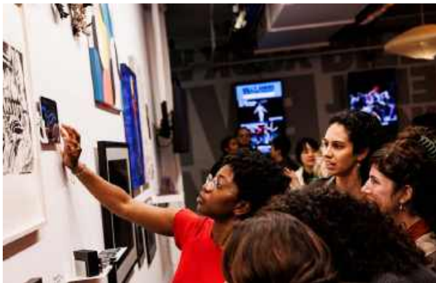
Image: The sixth "In/Between" exhibition at New York Live Arts, featuring works by NYFA IAP artists

NYFA established a partnership with New York Live Arts in 2019 to organize In/Between , an annual group show that highlights the work of NYFA's Immigrant Artist Program (IAP) mentees. The exhibition opportunity, now an important part of the program, aims to enhance the visibility of immigrant artists and stimulate discussions about their work. Last year, all 21 mentees participated in the sixth annual exhibition, In/Between: More-than-human . The works in More-than-human evoke power and myth through various mediums, share the untold/told lore of birth, family, tradition, land, and challenge the structures that police existence.