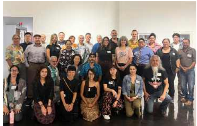
Image: Immigrant Artist Mentoring Program San Antonio participants, Photo Credit: Ju Hye Kim, NYFA

showcasing 26 artists from the 2024 cohort. These partnerships are fostering community building, knowledge exchange, and resource sharing among artists and arts professionals.