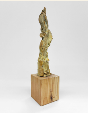
Marilyn J Friedman Totem Sketch, 1986 Gypsum cement 2.5 x 2.25 x 11 inches