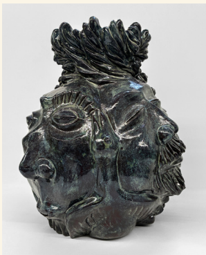
Noël Copeland Untitled , 2025 Ceramic 9 x 13 inches