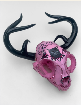
Alessandra Expósito Ginger, 2026 Mixed media 5 x 6 x 2.5 inches