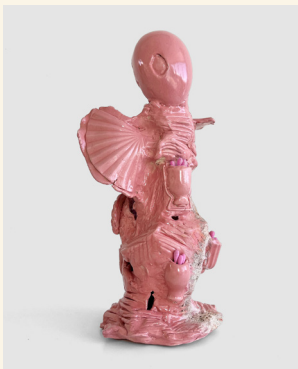
Amy Brener Steward , 2026 Glazed stoneware 13 x 6 x 6 inches