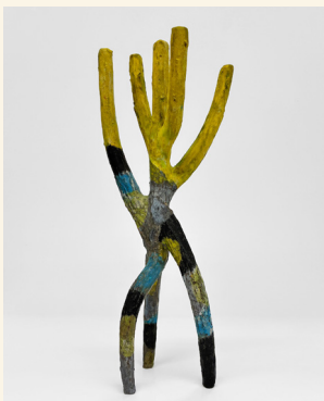
Linda Casbon Yellow Shadow , 2023 Clay and glaze 6 x 4 x 14.5 inches