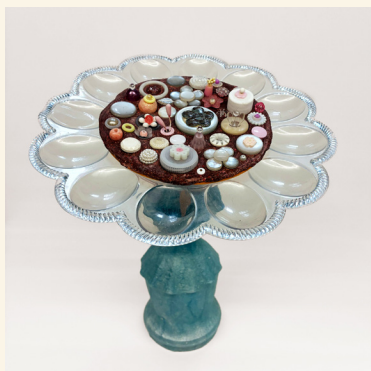
Kirsten Hassenfeld Bud vase , 2026 Recycled plastic, glass, ceramic, shell, metal, wood with mixed media 14 x 8 x 8 inches