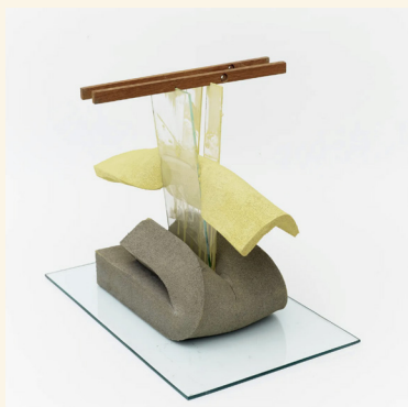
Dave Hardy Untitled , 2013 Glass, cement, polyurethane foam, paint, tape, teak 16 x 10 x 13 inches