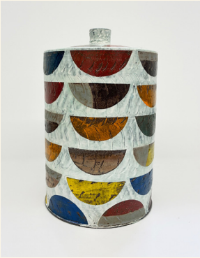
Sanam Emami Storage Jar, 2023 Stoneware, stencils, slip 10 x 6 inches